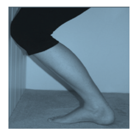
Example of a running screening test.